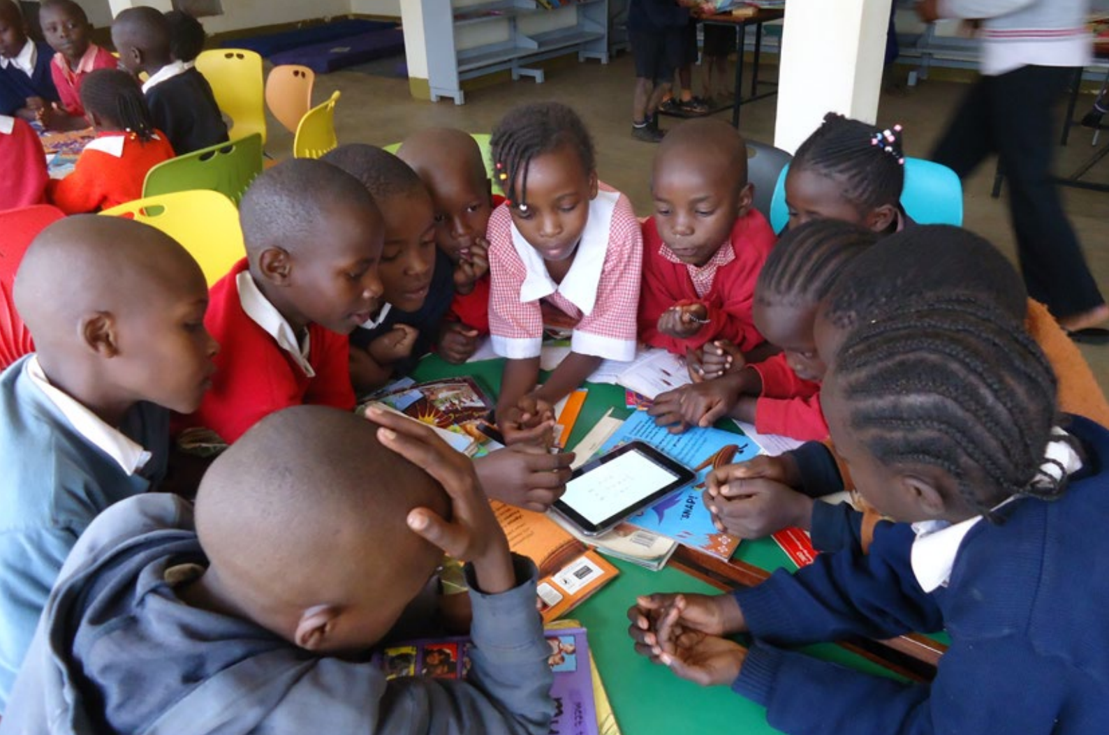
Children keenly navigating through the tablets at Kibera Library.