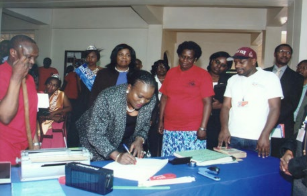
Dignitaries sign the visitors book at the knls stand at KU during disability function.