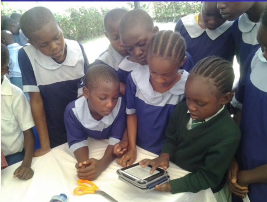
Children exploring e-readers at Kakamega library.