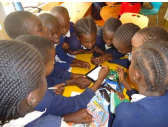
Children keenly navigating through a tablet