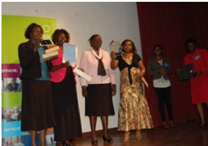
Buruburu Library staff receive a Trophy, Tablet, Certificate & cash award of Kshs. 50,000 for emerging the Winner.