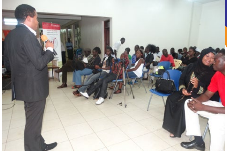
Youth training at Kisumu Library.

On 14 th October 2013, American corner organized a one-day book club workshop for teachers at Discovery International Academy for 29 schools along the border of Gem and Emuhaya constituencies. The workshop was aimed at