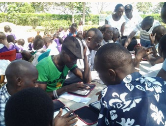
Readers familiarize themselves with the e-readers during the launch at Nyilima.