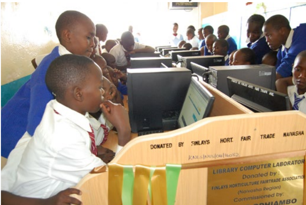
School Children testing the internet services at the newly refurbished ICT Section at Naivasha library.

Finlays Horticultural Fairtrade Association Boosts knls Naivasha Library's ICT Section