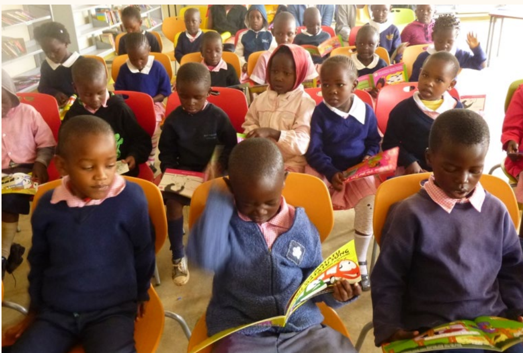
Some of the library beneficiaries of Kibera Library.