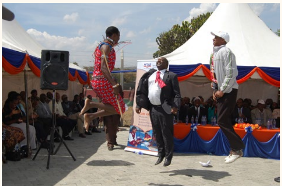
Narok County Governor (Centre) defies the law of gravity.