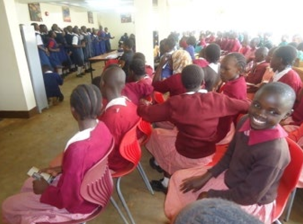
School girls in a teen-age workshop at Kibera library.