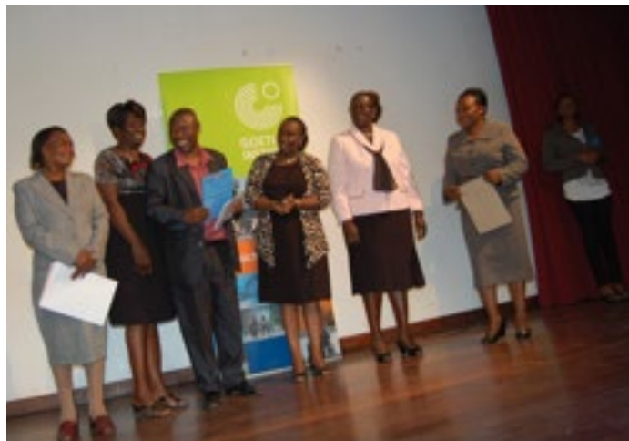
Nairobi Area Library staff receive a certificate and cash award of Kshs. 30,000 for being the 1st Runner Up.