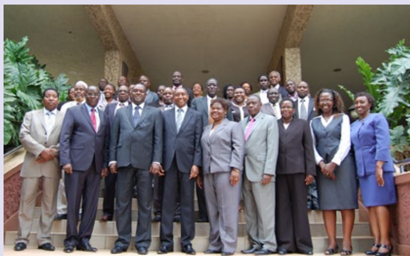
knls Board & mgt staff who participated in the initial devt. of the knls Transformation Strategy, with the CS Dr Wario in Feb. 2014.

The two-day retreat was officially closed by Dr. Hassan Wario, Cabinet Secretary (CS), Ministry of Sport, Culture and the Arts. The CS said that he was impressed by the idea of sustainability noting that this was in line with government's thoughts to have all government agencies sustain themselves. He challenged the Board and Management to come up with initiatives that would attractively sell the TS.