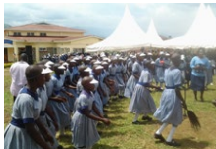
Children entertaining guest during the launch of Dr. Robert Ouko Memorial Library.