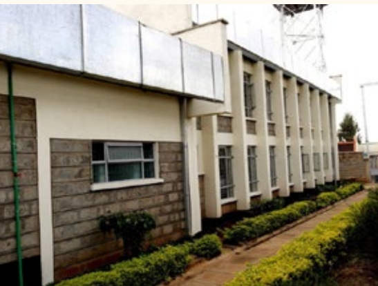
Side view of Kibera Library.

that is under the management of the knls Board. They also funded construction of a community ablution block next to the library that provides the residents with sanitation services and clean water. The family spent about Ksh. 40 Million for the construction and equipping of the library.