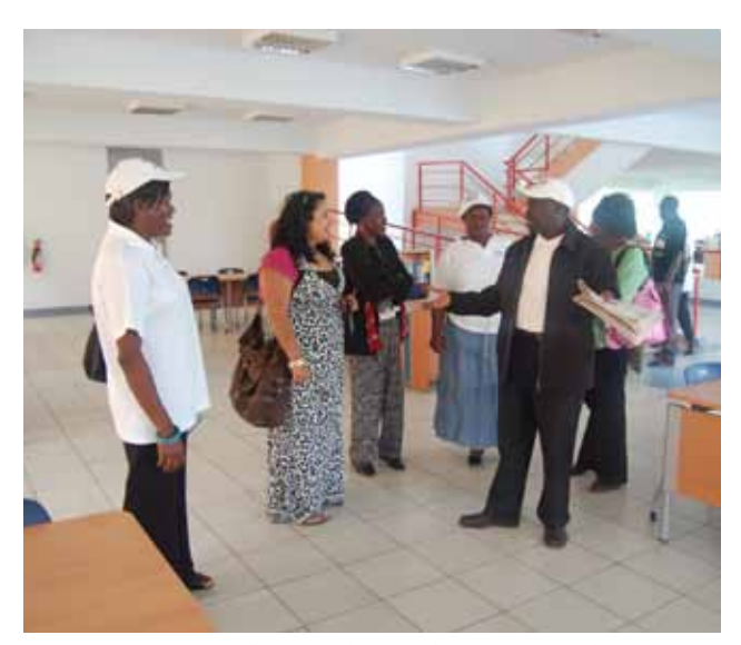
Guests arrive for the Buruburu Library open day