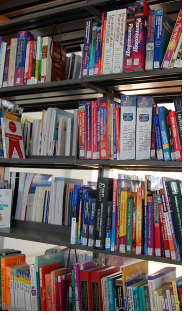
A collection of books at the new KNLS Buruburu Library