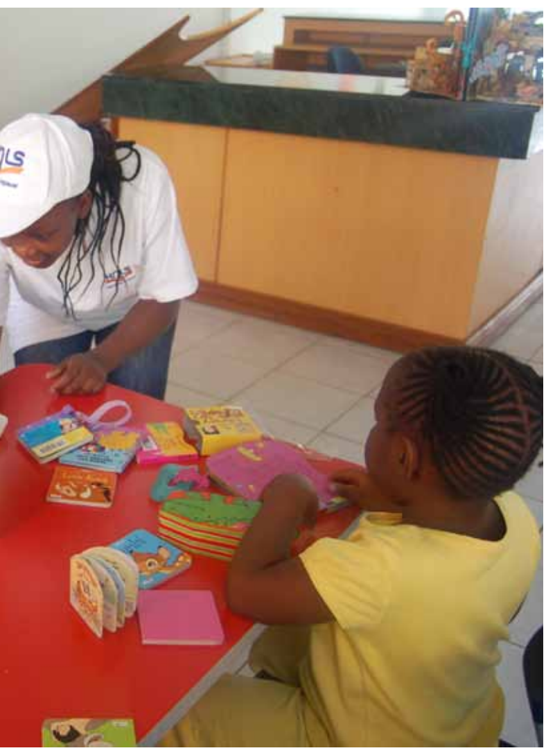
at the new Buruburu Library