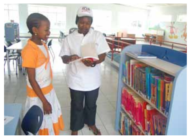
A junior library user is taken through the children section at the new Buruburu Library