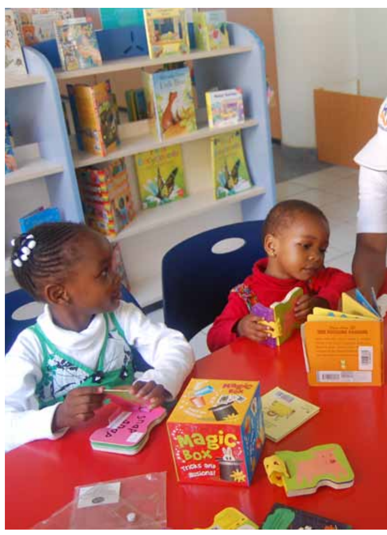
Children play with toys at the children's section during the open day