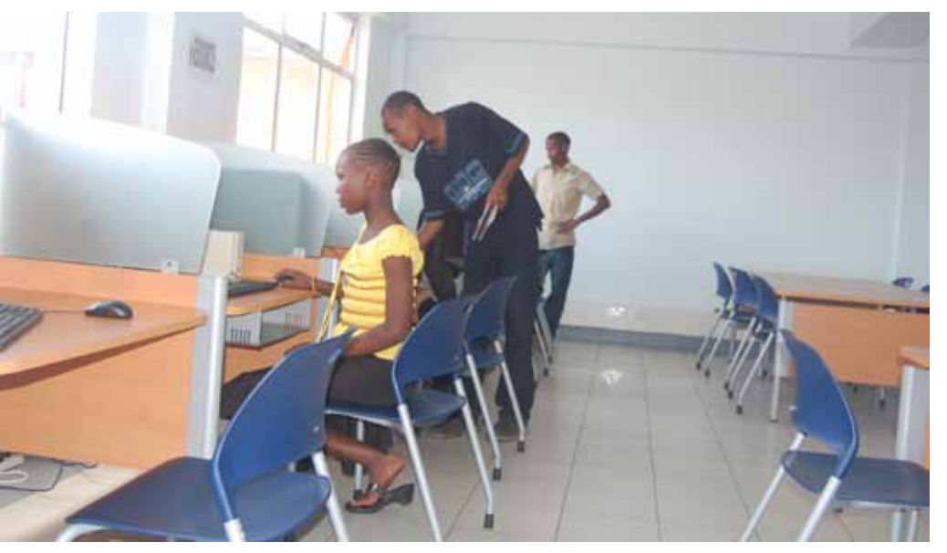
Customers access services in the Buruburu Library cyber cafe during the open day

n Saturday 19th February 2011 KNLS held an open day at the new Buru Buru Library Branch situated at the junction of Mumias/OI Doinyo Sabuk Road. This was an opportunity for the members of the public to learn about the library services lined up for them.